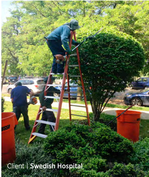
Client | Swedish Hospital