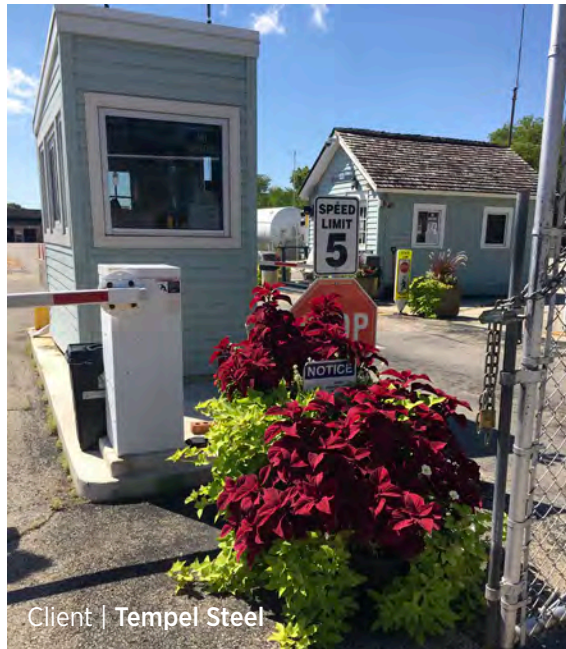
Client | Tempel Steel

Greenlawn Landscaping specializes in maintenance programs